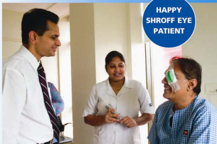
– Satisfied Cataract patients at Shroff Eye